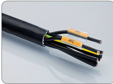
PFC in PT+PFC sleeve