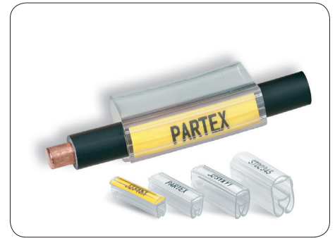
Printed marker tags mounted in sleeves.