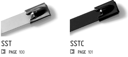
SST PAGE 100