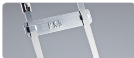
Customized, pre-stamped multi-character marker.