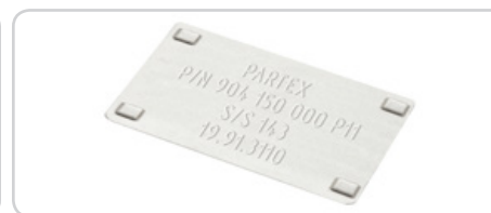
Customized, pre-stamped multi-character marker with four line of text.