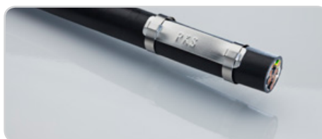
Customized, pre-stamped multi-character marker mounted on a cable.