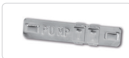
PKS10040-PKS10120 not stamped with text can be used as carrier strips for single-character markers. The carrier strips can also be pre-stamped and combined with single character markers.