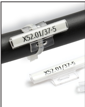
PP-profile + a PTM10 sleeve, mounted on a cabler.