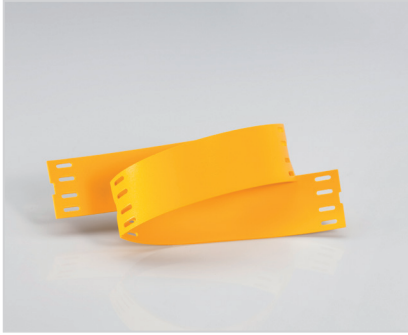
PPQ+19060 profile for printing in Partex MK10