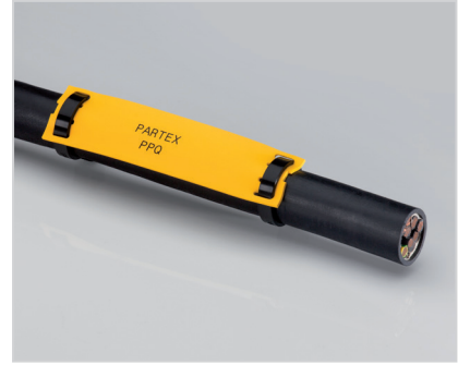
PPQ+19060 mounted on a cable.