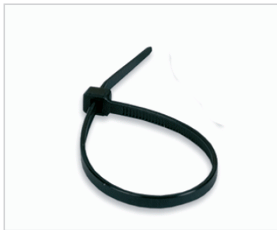
PPQZ in mounted with cable ties.